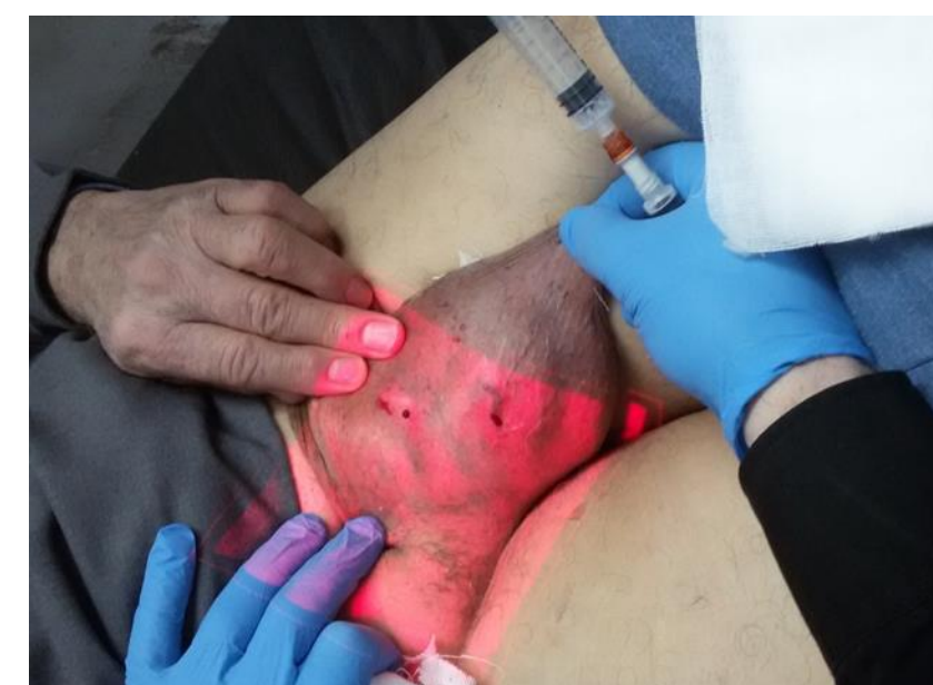
Easy lesion &feeder visualization By Accuvein