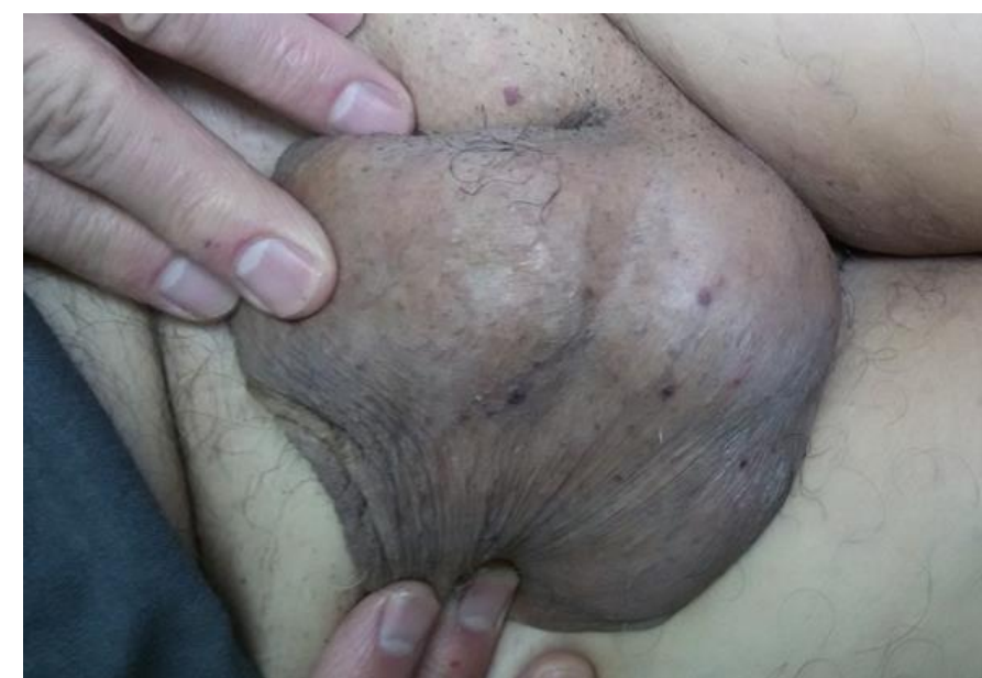
Difficult lesion &feeder visualization

Twenty male Patients( age ranged between 38 – 60 years) with previously mentioned lesions. 0.5-1% foam polidocanol using easy foam kit and AccuVein AV400 infrared Laser for accurate injection and clinical follow up.